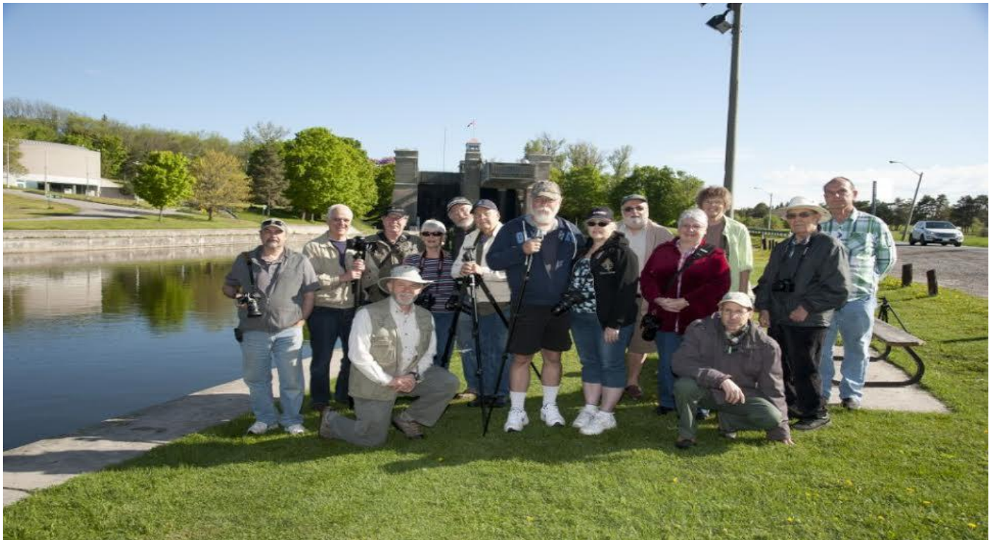
Members of the PPS enjoyed a Breakfast Shoot May 25 at the Peterborough Liftlock. A good time was had by all who attended.