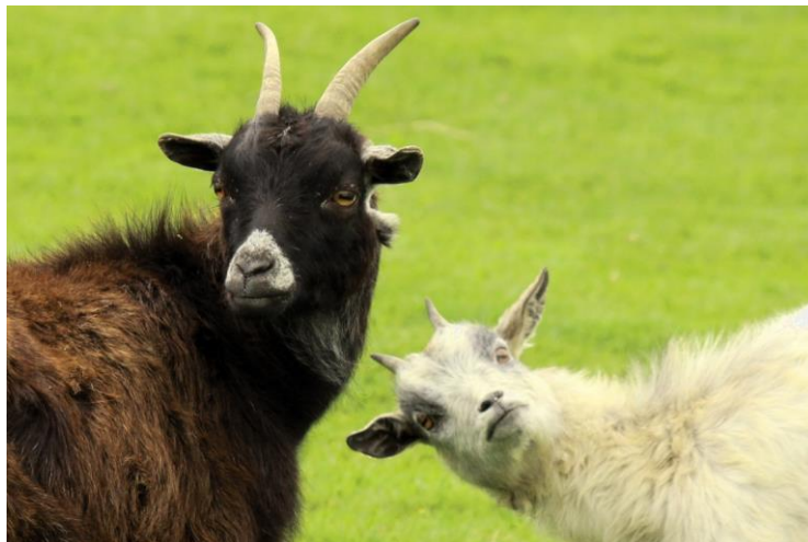
Lori Cummings' photo, Are you Serious? , placed first in the Novice class.