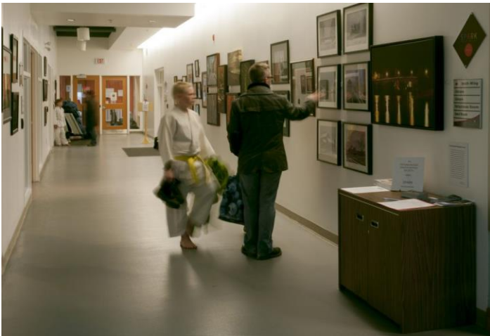
(Above) Passersby at the Peterborough YMCA admired the PPS display during the 2014 SPARK Festival. (Below) The crew which put up the PPS display at the YMCA did an amazing job.