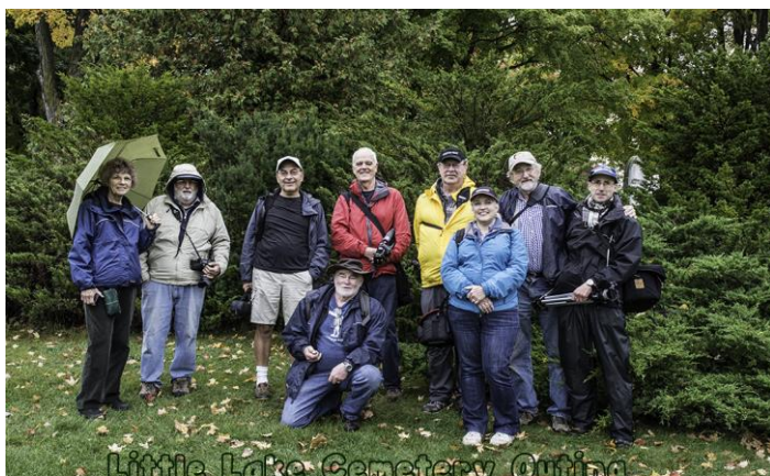
Little Lake Cemetery Outing

However, all content remains the intellectual property of the creators and is copyright by them. It may not be copied, reproduced, printed, modified, published, uploaded, downloaded, posted, transmitted, or distributed in any way without the Artist/ Photographers written permission.