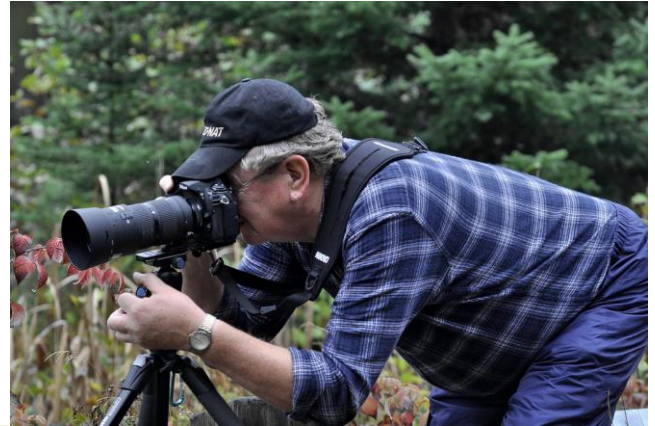
This PPS club member certainly seems caught up "in the moment" in this image captured by a fellow club member during the Algonquin Park outing. – photo

now to arrange your props for photography before the ground freezes, and look forward to the overcast, frosty winter days ahead.