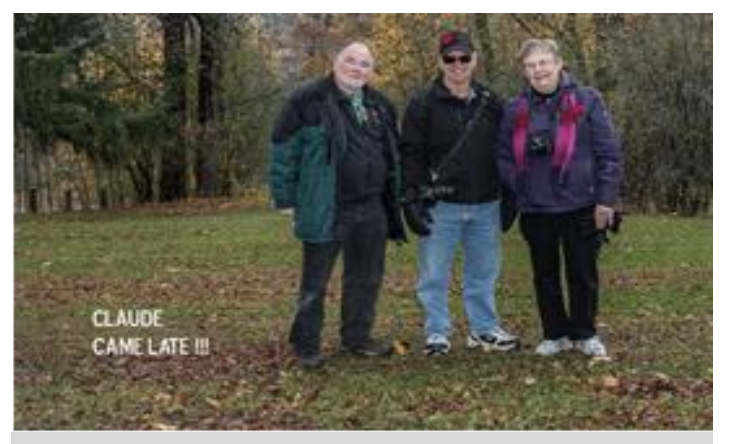
The PPS November Breakfast Outing took place at Nichols Oval. It was one of the cooler days this fall and was overcast with light flurries.