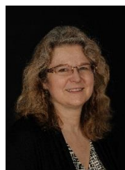
Suzanne Schroeter Website / Facebook