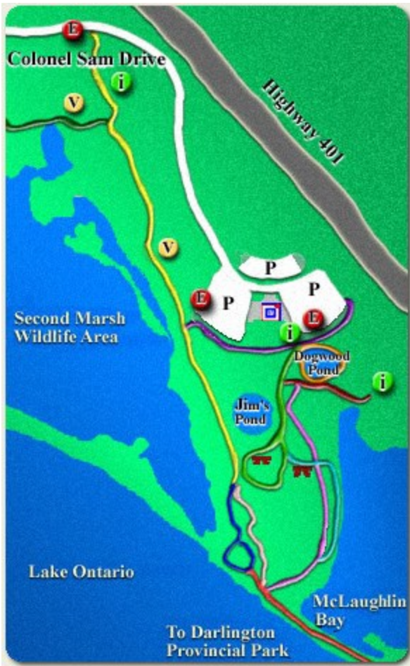
Map of the Dogwood Trail at McLaughlin Wildlife Reserve