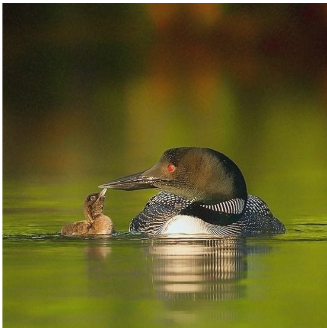
Currently on Display at the "Wildlife Photographer of the Year" exhibit at the Royal Ontario Museum.