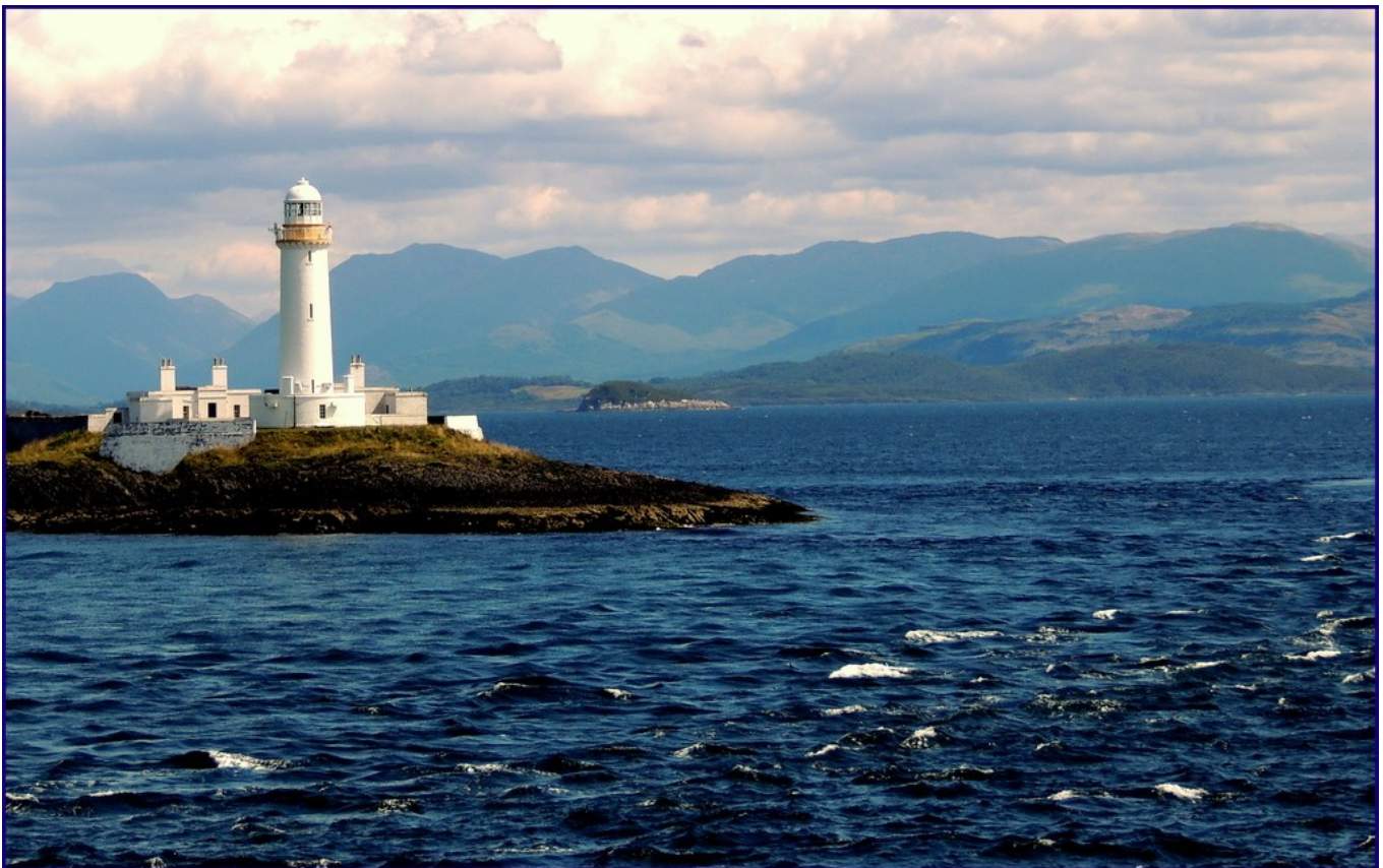
Lighthouse on the way to the Isle of Mull.

When I was visiting Scotland, I thought I was taking the ferry to Mull of Kintyre, where Paul McCartney lives, and where he wrote his famous song. I discovered that the Isle of Mull is a completely different place. A lovely Scottish lady in a shop told me the bad news with a smile on her face.