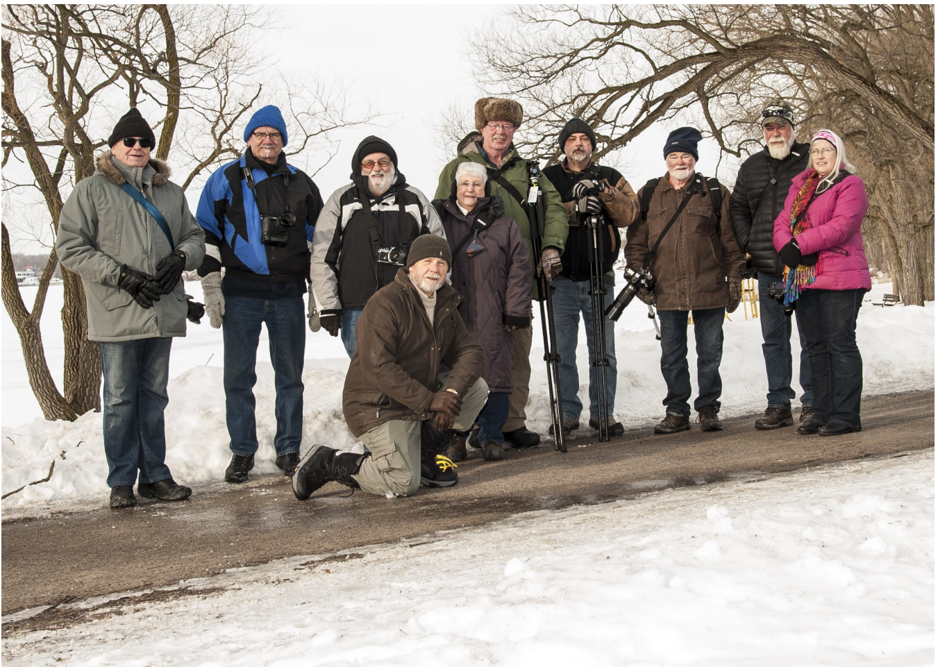
Roger's Cove Outing