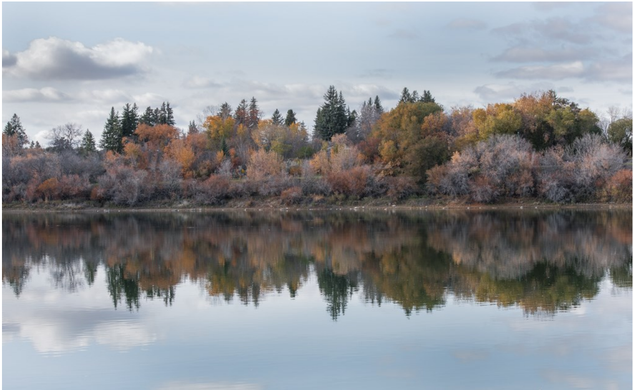
The North Saskatchewan River