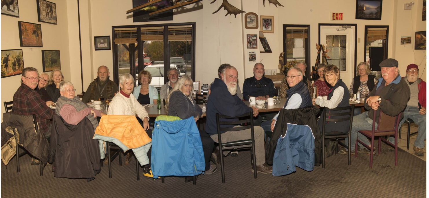
It was a great crowd that attended the Algonquin Park Outing and dinner at the Mad Musher.