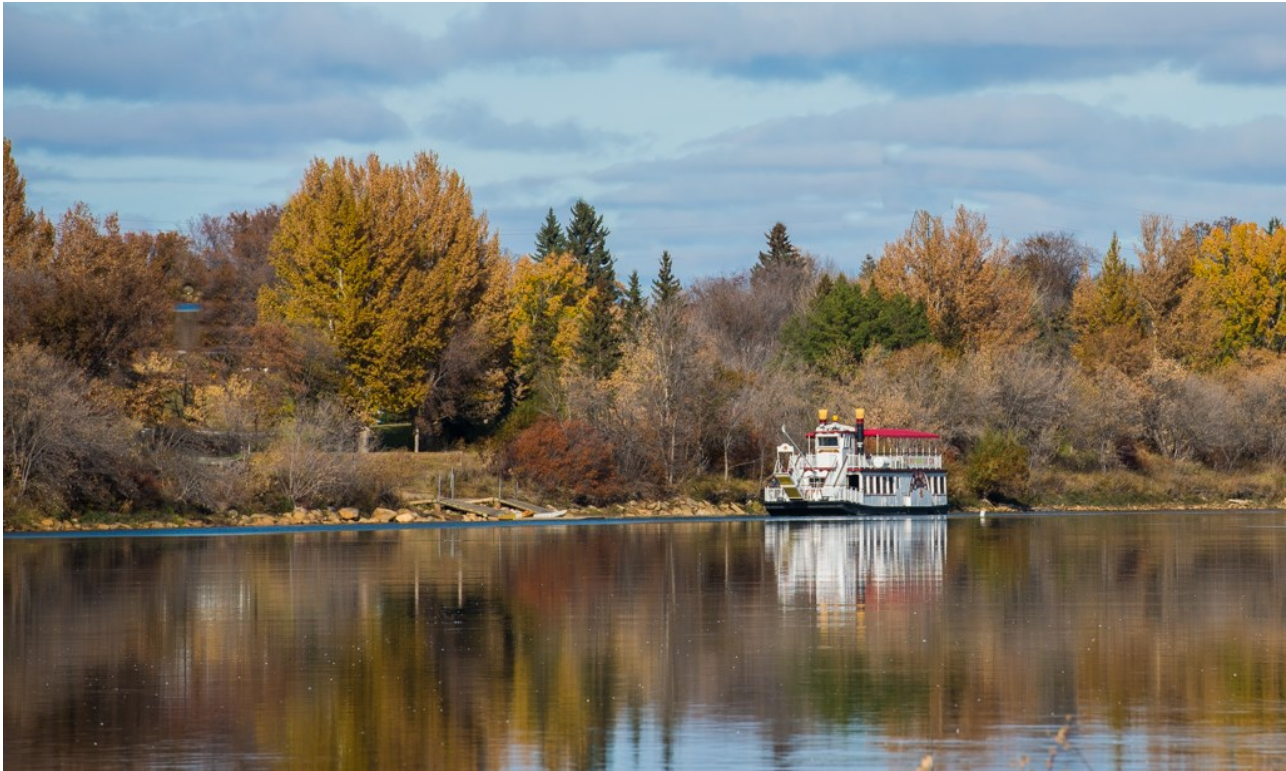
The North Saskatchewan River