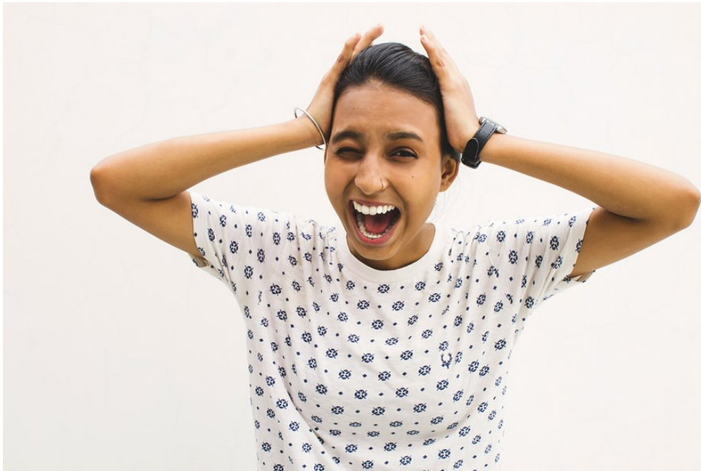
Egads! “This is My Photo” has morphed into “This is My Photography!”

Please refer to page 9 of this newsletter to get instructions on submitting your slide shows.