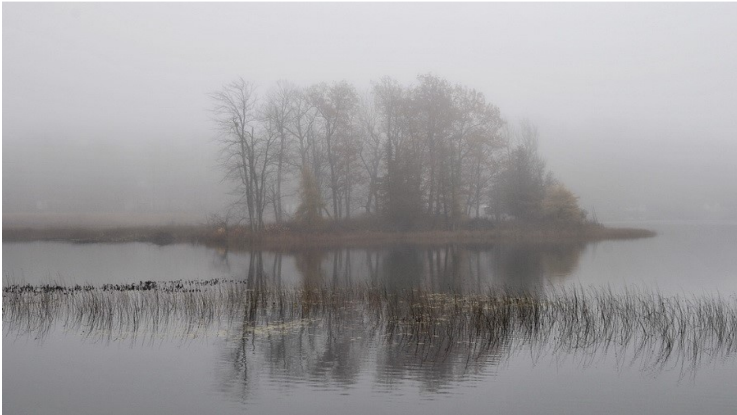
“Misty Morning”, by Brian Crangle