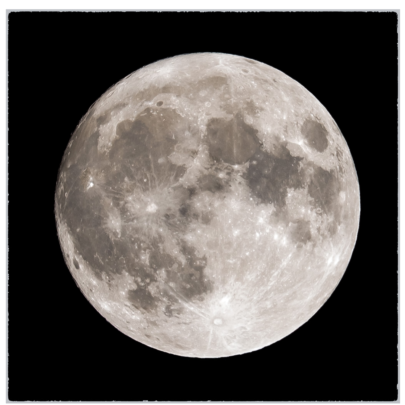
"Blue Moon", by Claude Denis