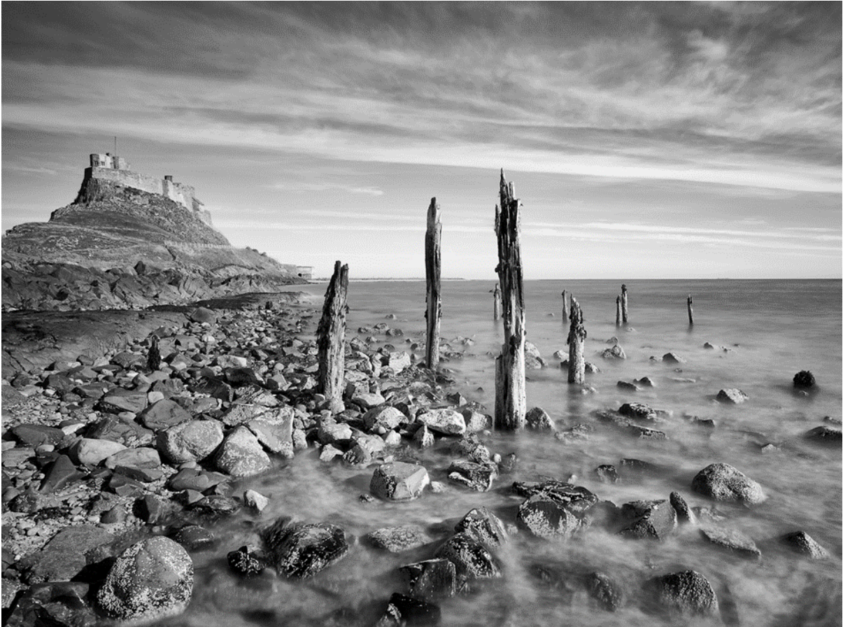
“Lindisfarne Castle”