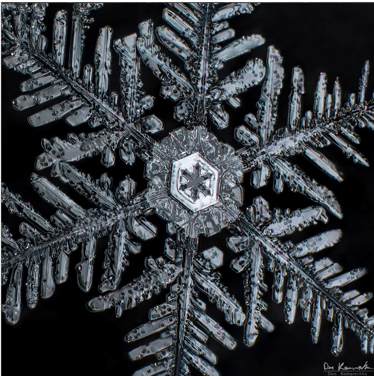
"Snowflake", by Don Komarechka

You can view Don's remarkable portfolios at www.donkom.ca