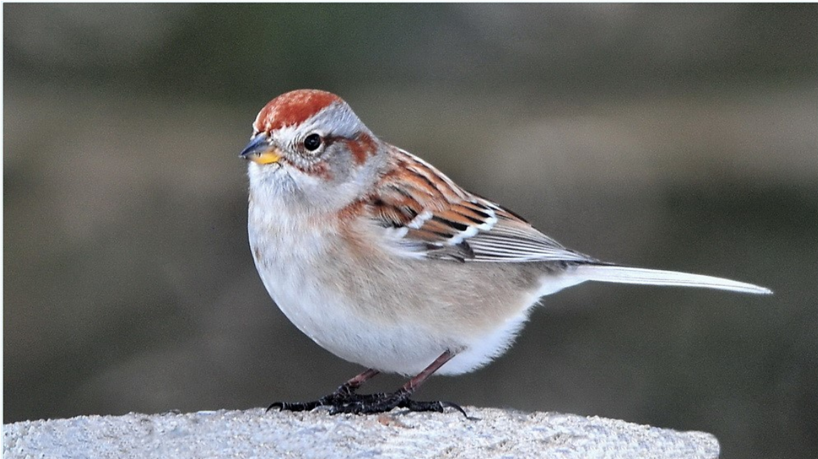
“Chipping Sparrow”, by Brian Crangle