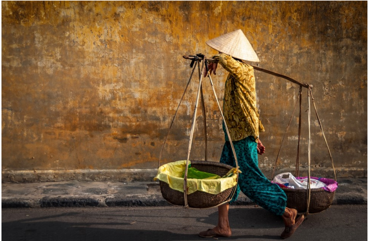
“Early to Market, Hoi An, Viet Nam”