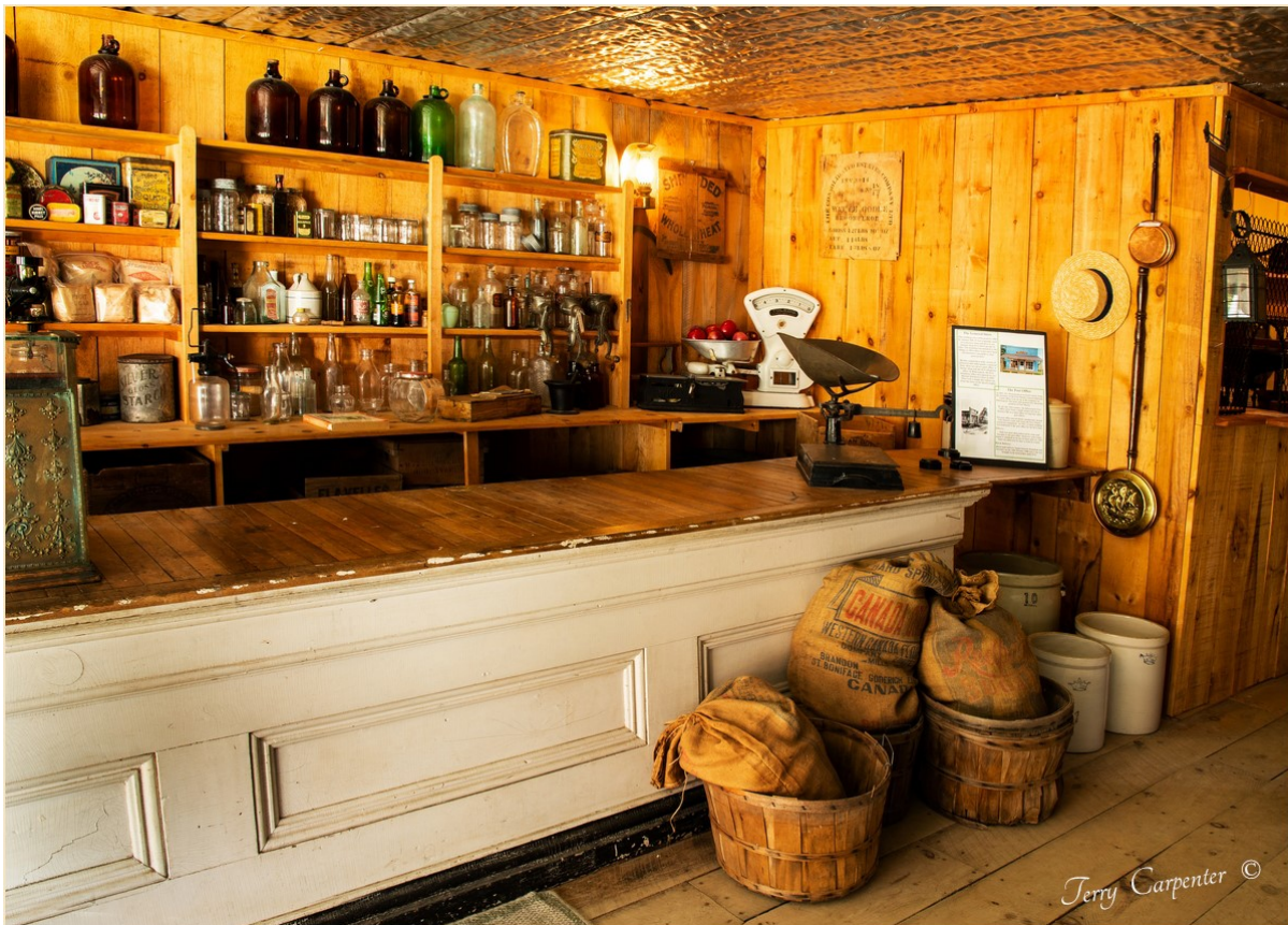
“Inside the General Store”