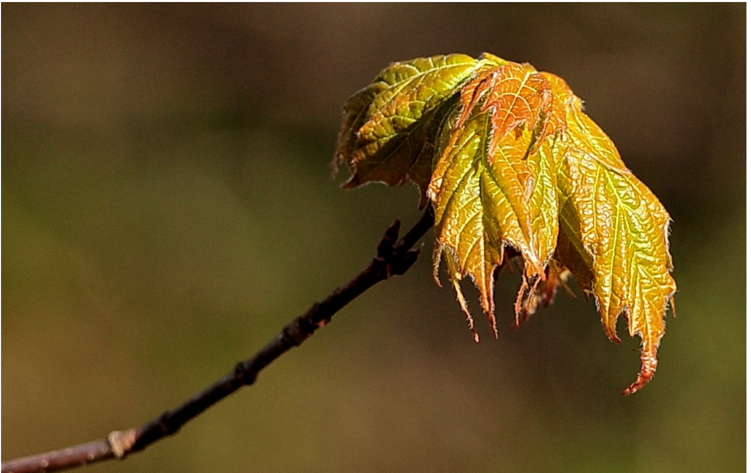
"Sign of Spring", by Brian Crangle

Exhibit, p 17 Image Submissions, pp 18-19 From the Editor's Desk, p 20 Notices, p 21 The Viewfinder Information, p 22 The Parting Shot, p 23