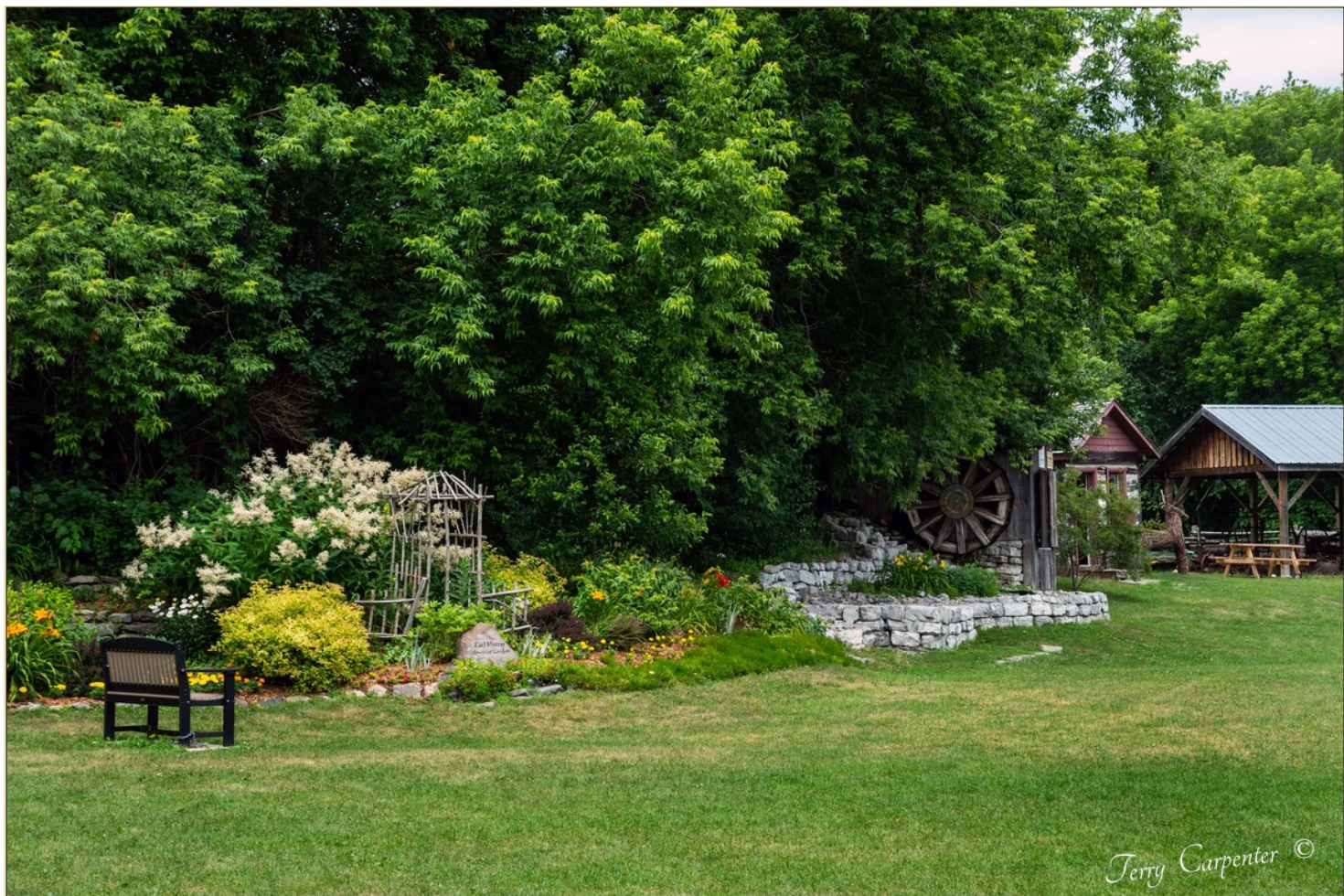
"Water Wheel at the Settlers' Park"