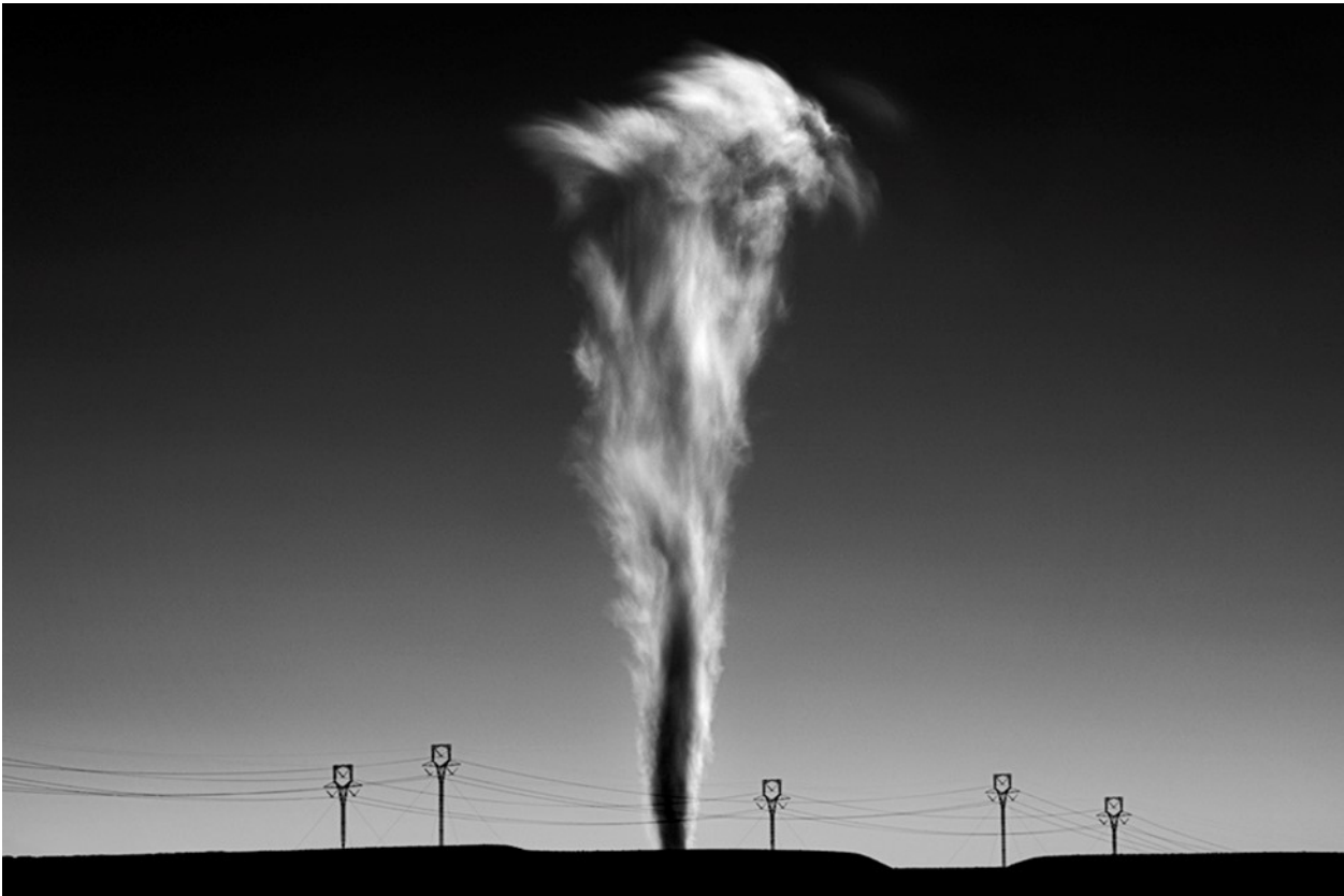
“Power Lines No. 25”, by Cole Thompson