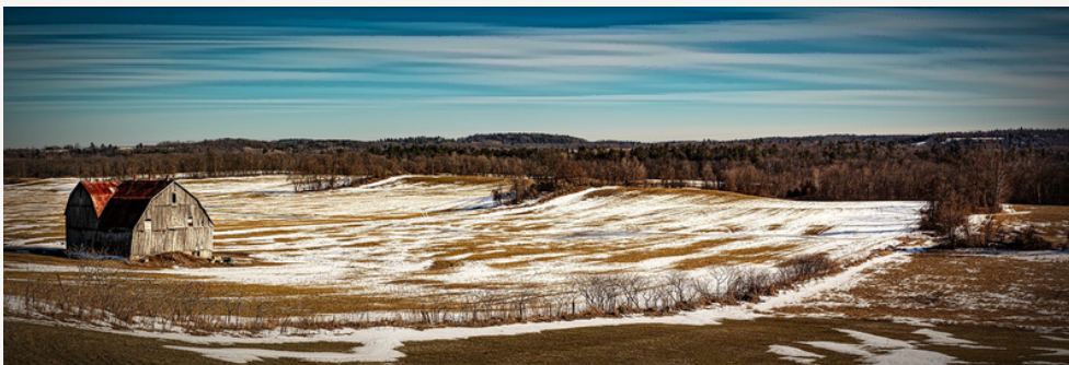
MELLOW MIDWINTER GUY RIDGWAY

https://peterboroughphotographicsociety.com/image-submission-instructions/