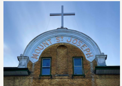
THE MOUNT COMMUNITY CENTRE

Submit one image for the April slide show to the Monthly Location Challenge Dropbox link on the PPS website by midnight March 28, 2023.