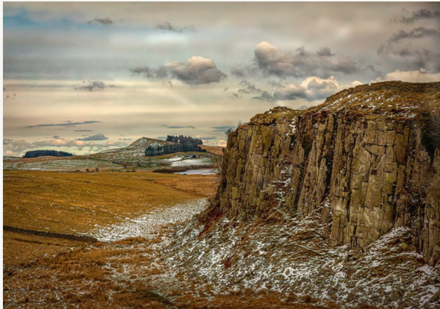
THE WHIN SILL AT CRAG LOUGH, NORTHUMBERLAND, UK

https://peterboroughphotographicsociety.com/program-calendar/